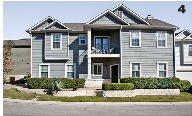
1) Island kitchen with built-in breakfast space 2) From the kitchen, this is the view of the main living room 3) Upstairs, a cozy reading room just off the master bedroom 4) 2-story layout has 3 bedrooms, 2.5 baths, side-entry garage and about 1,855 sq. ft.