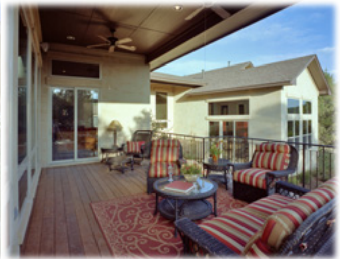
How's this for creating outdoor living space?