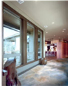
Room for artwork at the entry

saic of various tiles. This flowing, open space is lipped with a wall of high-placed windows...and this provides beams of filtered light without sacrificing privacy. Typically, the bath, shower and dressing areas are segmented by walls and doors. The same division of space is accomplished here with a curved wall that looks like a piece of freestanding sculpture (see photo on