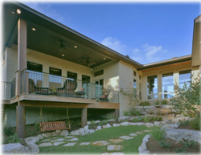
U-shape wraps around a water element in back