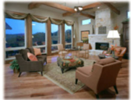
▲ Dining space built into the kitchen. View of family room

looking, heavy, wooden, metal-banded doors and there are stained glass windows inside. The room can be used as a Parlor for wine tasting.