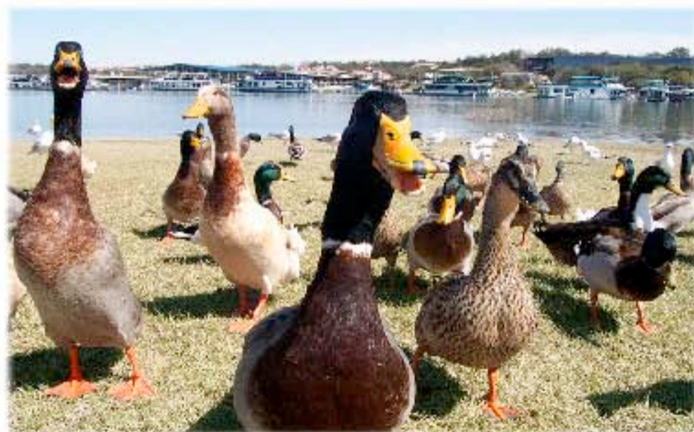
There is a waterfront park just down the street with friendly ducks, jogging trails, dog obstacle course and fishing pier