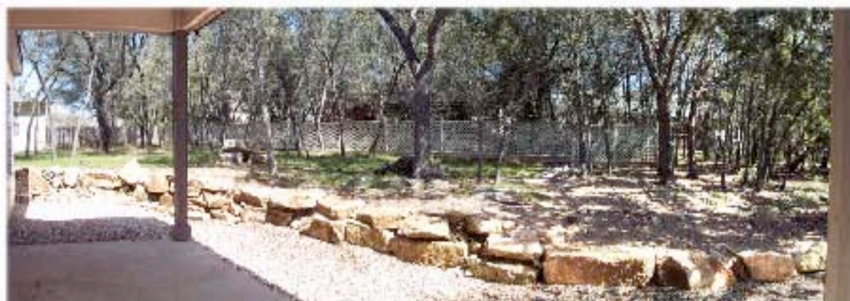
The huge back yard is covered by a canopy of shade trees

You would never think of a garage as being anything special...but once again you will find this home exceeds your expectations. It has an oversized garage with nine foot doors (instead of the typical eight foot units) which means you can easily navigate a big car or SUV into this space. The garage is room finished with painted sheetrock and baseboards. The garage floor is painted with a special oil-base paint that will stand up to any workshop hobbies you have. There are four