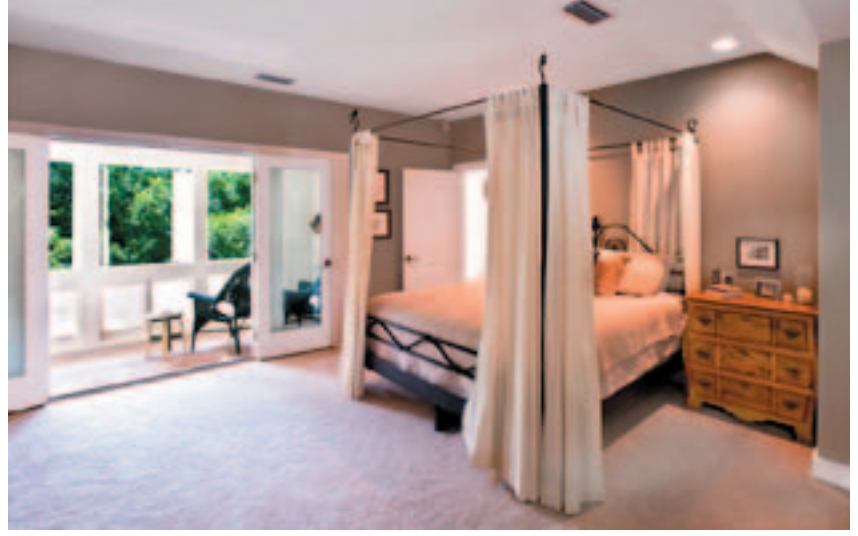
Artisan-finished kitchen cabinets. The romantic master has a fireplace and windswept lanai...you can sleep with the windows open.

Built in 1995, the address of the home is 3101 Rivercrest Drive . It has three bedrooms, three fireplaces, library, artist's studio and two large attic rooms for storage of bulky items like suitcases, camping gear and holiday decorations. There are two average-sized bedrooms on the first floor—the large master bedroom (with fireplace and sitting room) are on the second floor.